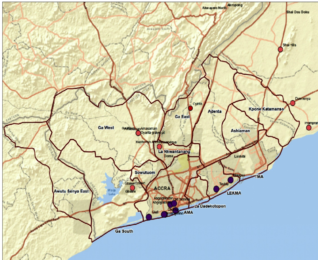
Figure 3: Major types of pollution related to land use in GAMA

In ranked order, land-use activities identified and discussed at the workshop are residential, industrial, mixed-use, commercial (markets), transportation, water bodies and wetlands, historical preservations, sanitary areas, and green areas/parks. The discussion revealed that the forms of pollutants produced by land-use activities are similar in certain cases, while others are unique to specific locations or communities.